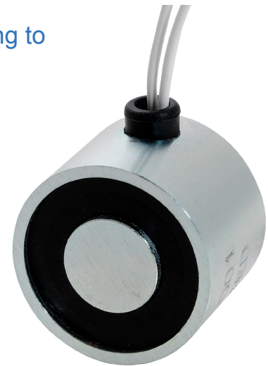
Type GMH X020X00D01 Fig. 1