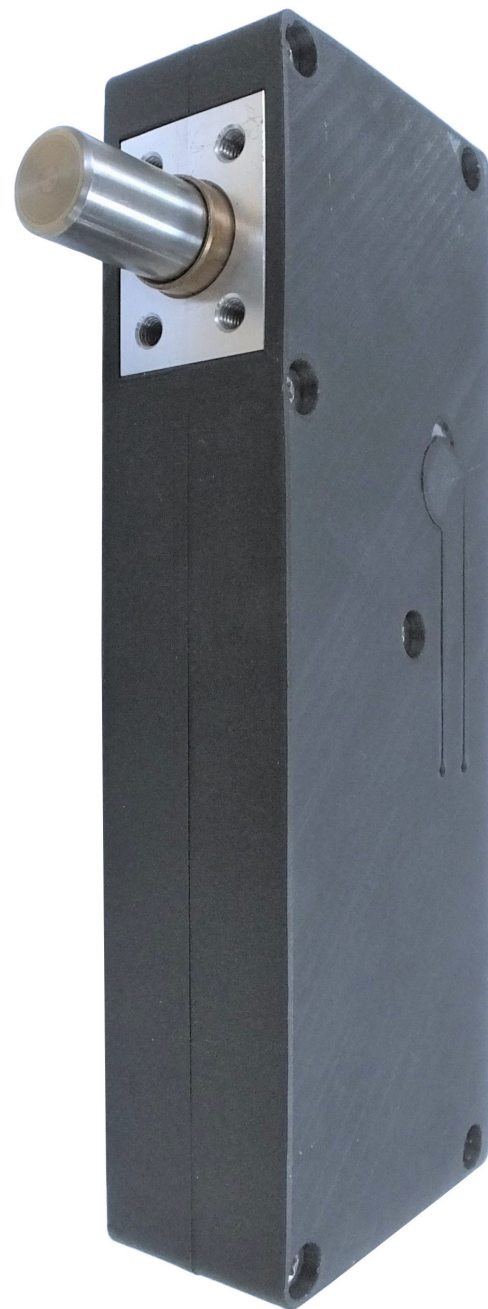
Fig. 1 TALL-1515