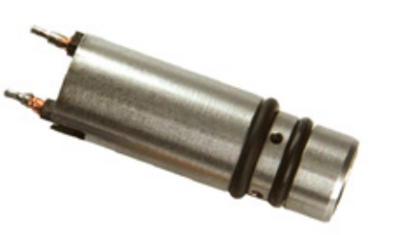
Fig. 1: V PK M 007 K00 A03/A04